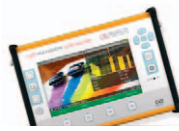
HD RANGER UltraLite