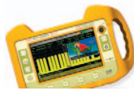
HD RANGER Eco