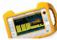
RANGER Neo Lite