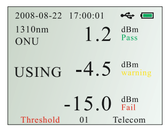
Fig.3 Threshold Setup Menu

NOTE: The threshold value can only be preset by PC software. See PC software section for detail.